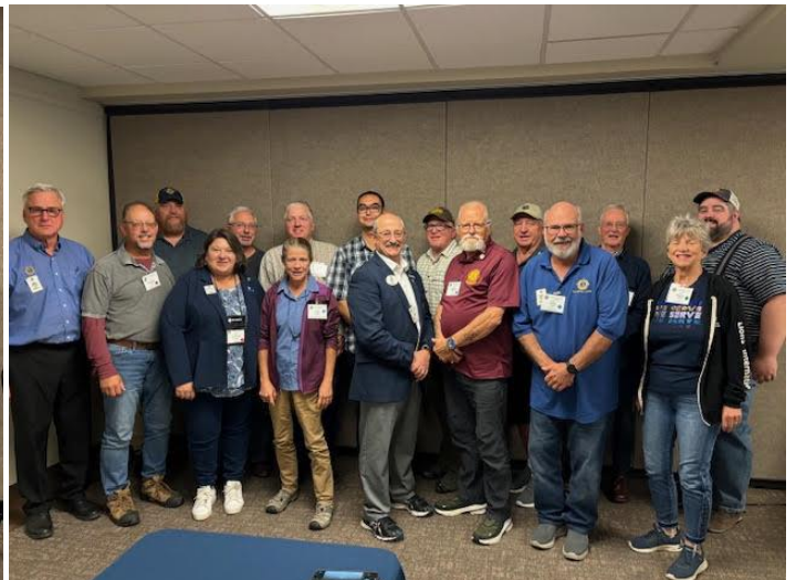
Class of 2024 w/GLT team