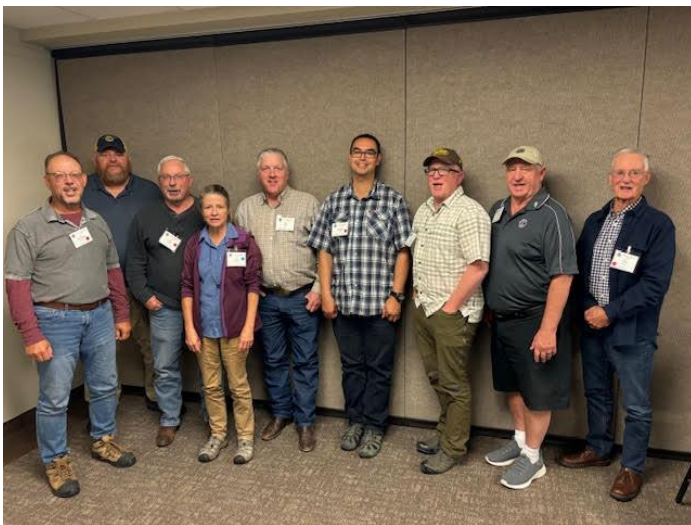
Class of 2024

The retreat was a resounding success, providing attendees with new tools, perspectives, and connections to further strengthen Montana Lions District 37 in the coming year. Lions are encouraged to consider attending next year's retreat for another opportunity to grow, connect, and lead. Don't miss out on the valuable experiences and insights this retreat offers!