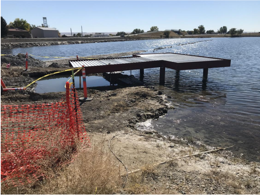
Part of the Laurel Lions Club “pond improvement project”