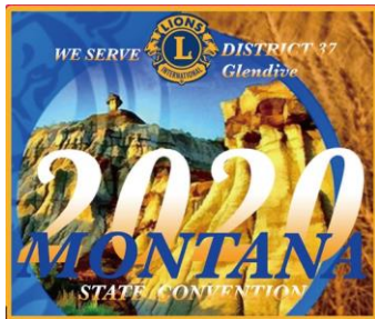
2020 Montana State Convention Pin

A Thank You ... from the Glendive Lions,